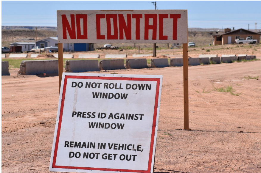
Notification of new distribution policies

First, we adjusted our distribution model at our warehouse and trained partner organizations throughout Arizona on Best Practices to providing “no-contact distributions”, limited-contact distributions, to maintain social distancing.